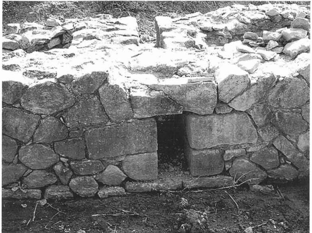
FIG. 3 - The sewer outlet on the Varignano warf used as a sea-level indicator: the base of the outlet could not be lower than the maximum high tide value.