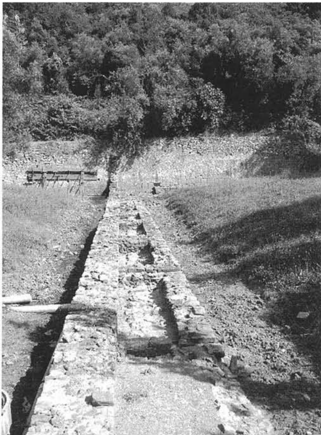
FIG. 2 - General view of the wharf of the Varignano villa.

In lack of other remains (i.e. piscinas ) considered the best markers for the determination of Roman Times sea-level (Lambeck & alii , 2004 b), we chose to assume the