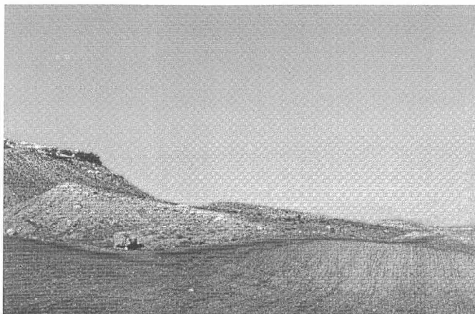
FIG. 1 - Triangular slope facets in Monteagudo de las Vicarías (Eastern sector of the Duero Basin, Soria Province).

and the underlying labile sediments allow the individualization of talus flatirons. In addition, scarps must be formed by a relatively thin caprock, so that debris accumulation does not become excessive (Schmidt, 1987) and the scarp retreat may be fast enough to allow the disconnection of the slope facets. On the other hand, the alternation of resistant and soft strata beneath the caprock inhibits talus flatirons development.