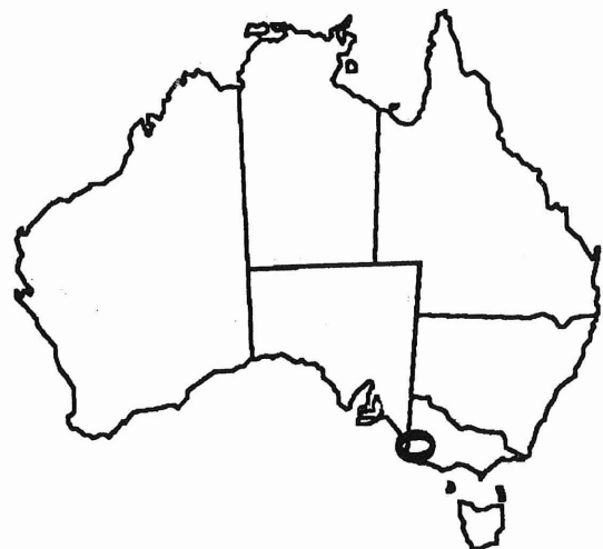
FIG. 1 - Location of the Otway Basin.

The Tertiary marine limestones are generally horizontally bedded, well sorted fine to medium grained bioclastic